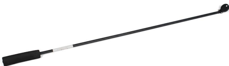
AM-320 Saltwater Submersible Sensor Wand

The AM-320 Saltwater Submersible Sensor Wand accessory incorporates a mounting fixture at the end of a 40-inch segmented fiberglass wand and is well-suited for saltwater use. The wand allows the user to place the sensor in hard reach areas such as aquariums. While sensors are fully-potted and fully submersible, the \mu Cache should not be submerged and should be kept in a safe, dry place.