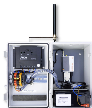
3G-DLC-BX1/SP and 3G-BX1/SP Modem Box