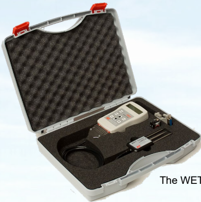
The WET Kit