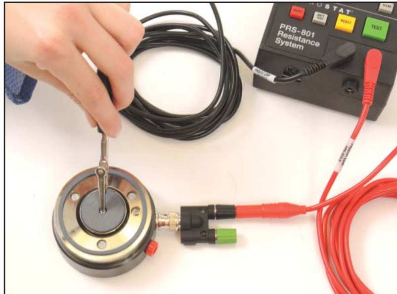
Figure 6: Confirming Center Electrode