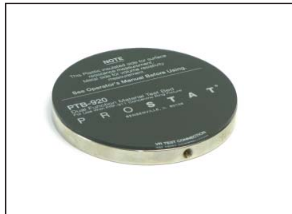
Figure 3: PTB-920 Dual Test Bed