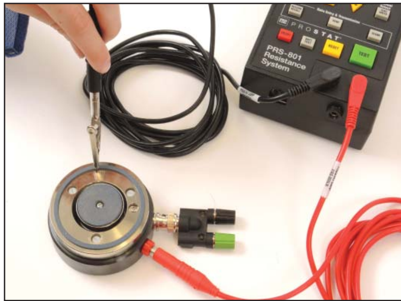
Figure 7: Confirming Outer Electrode