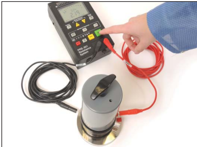
Figure 9: Confirming Electrode Contact to Test Bed